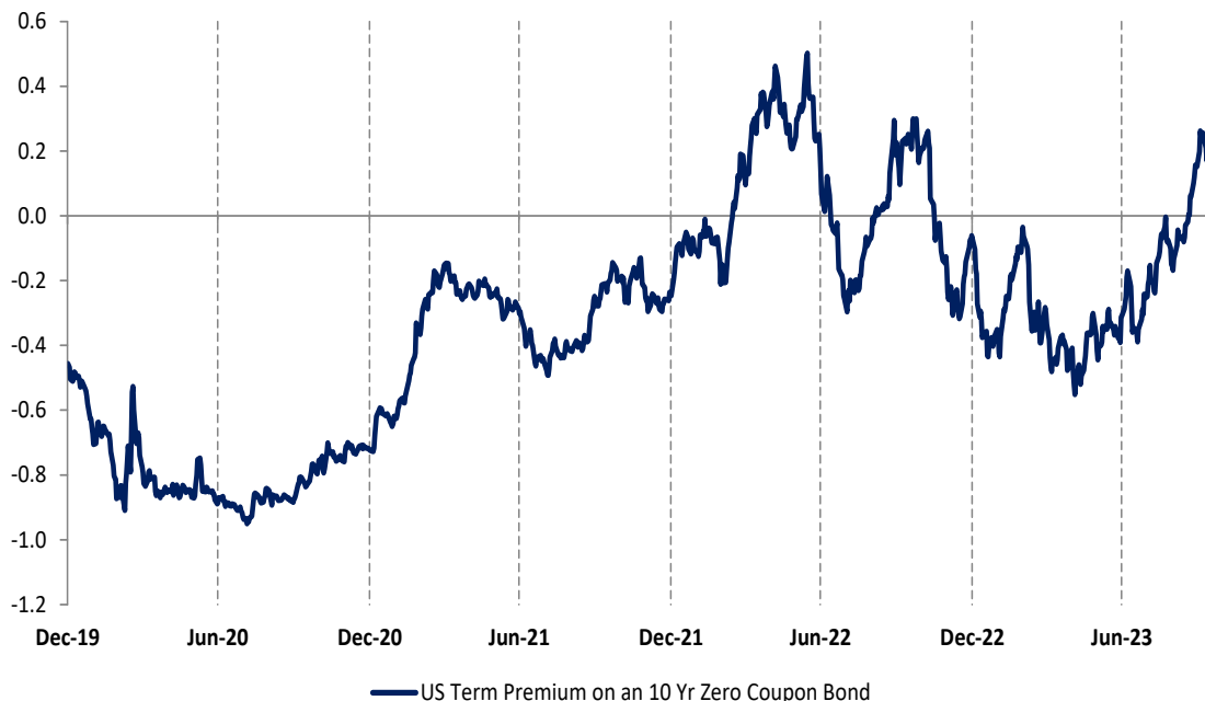
Figure 1. Equity Valuations Remain under Continued Pressure as Bond Term Premium Levels Edge Higher amidst Weakening US Corporate Guidance and Unattractive Valuations